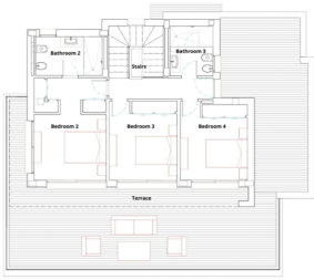
BLOCK 4 - 808 FIRST FLOOR