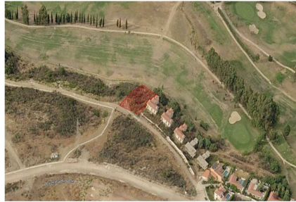
DETALLE VISTA DE PLAZADO