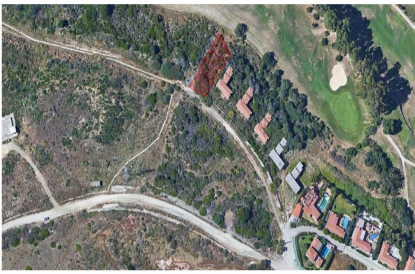
PUNTO DE SITUACIÓN

moments. This level also includes a 45 m 2 porch, a full bathroom and an outdoor toilet, as well as a private garden and a swimming pool that invite you to relax. With an approximate construction cost of €500,000, and with all the paperwork already taken care of, you can start building your house without delay. This property is ideal for property developers looking for a ready-to-develop project in a prime location, for families who want to build their home in a peaceful setting, and for investors looking for a property with excellent appreciation potential. Don't miss this opportunity to acquire a plot of land in one of the most exclusive enclaves in Estepona and start building the house of your dreams without complications!