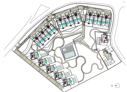
3 Bedroom Townhouse at La Vera de Marbella, Elviria