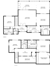
TOTAL 139 m 2 Below Ground: 90 m 2 , FLOOR 2: 141 m 2