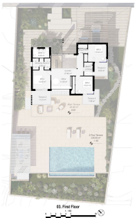
01. First Floor