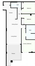
For Illustrative Purposes Only. Please Visit Our Properties To Verify.