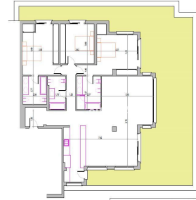
REFORMA DE APARTAMENTO HOTEL DEL GOLF - CI LONDRES, S/N - LAS BRISAS MARBELLA - MÁLAGA